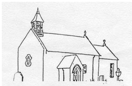
St Mary, Scawton