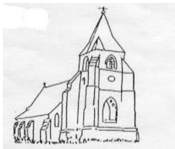
St John, Bilsdale Midcable