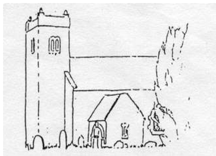
St Michael, Cold Kirby