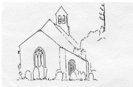
All Saints, Hawnby