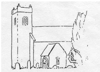
St Michael, Cold Kirby