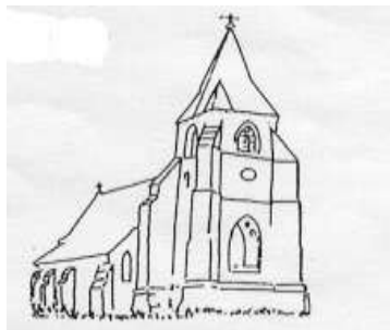
St John, Bilsdale Midcable