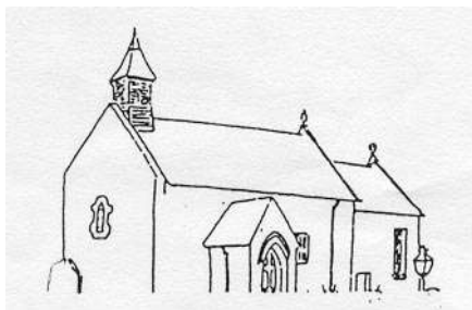
St Mary, Scawton