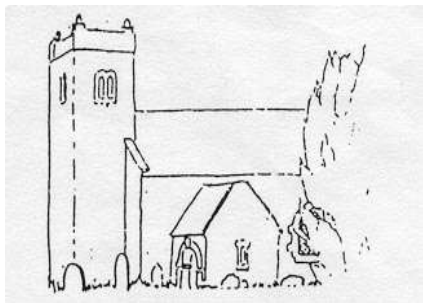
St Michael, Cold Kirby