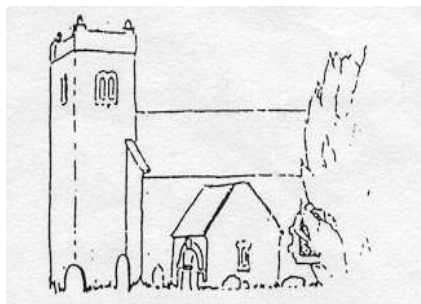
St Michael, Cold Kirby