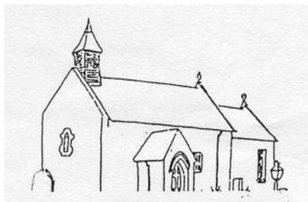
St Mary, Scawton