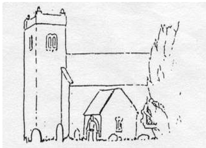
St Michael, Cold Kirby