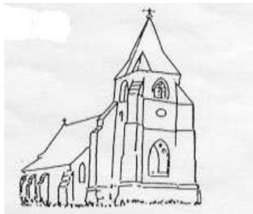
St John, Bilsdale Midcable