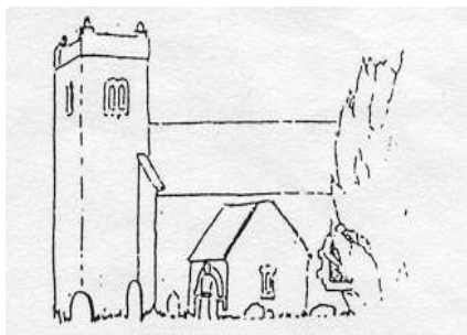
St Michael, Cold Kirby