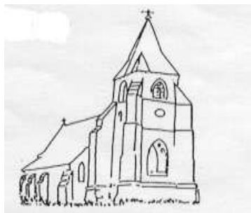
St John, Bilsdale Midcable