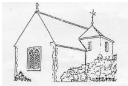
All Saints, Old Byland