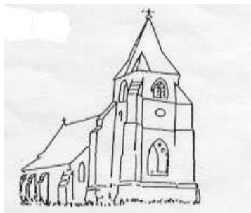
St John, Bilsdale Midcable