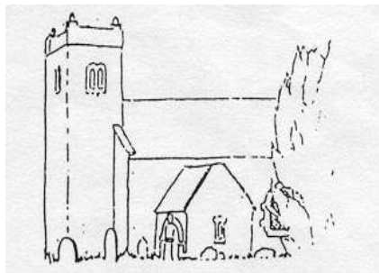
St Michael, Cold Kirby